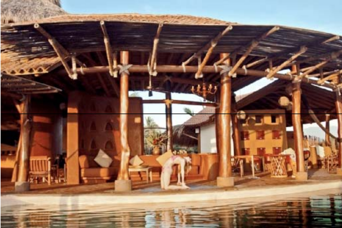
With yoga and meditation, your stay becomes even more enjoyable.